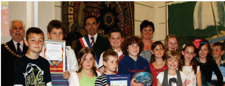
Winners: Parklands Community Primary School (above) and (below) 'Highly Commended' Bishop Luffa C of E Secondary School