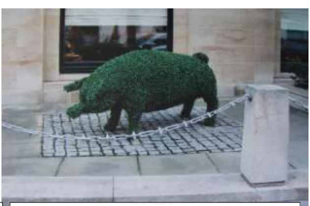
'LA CHASSE AU SANGLIER EST ARRIVÉE' Knightsbridge, London