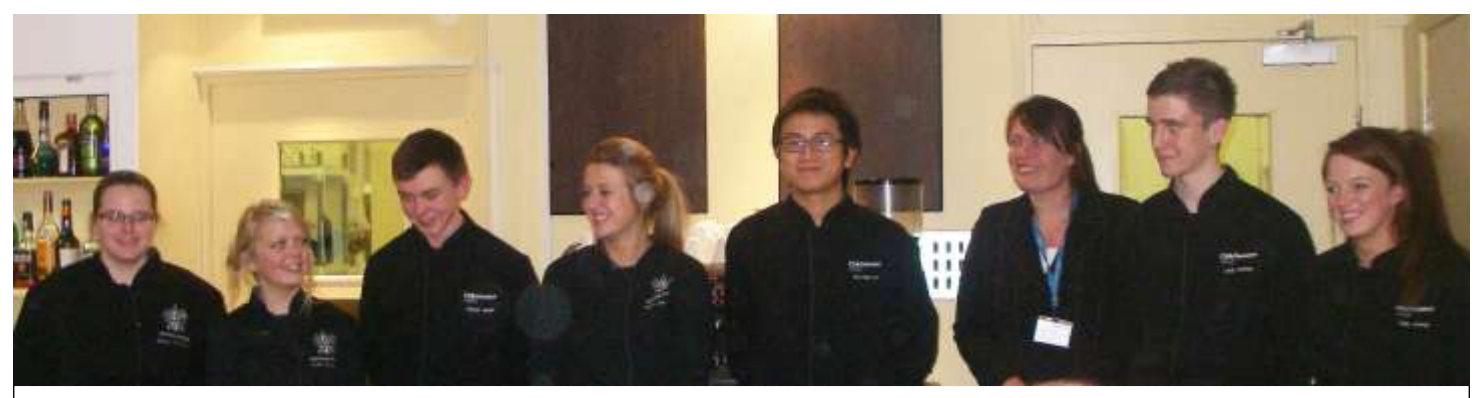
'Front of House students' who had been waiting on the tables during the evening were congratulated and presented with 'gratuities' collected on the evening which would go towards their end-of-year outing (including those students who had been preparing the meal) - often a day trip to France.

Darne de Saumon Sauce Hollandaise (Poached salmon darne with hollandaise sauce)