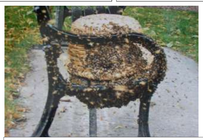
'SWARM OF BEES ON PARK BENCH' New Park, Chichester