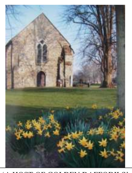
'A HOST OF GOLDEN DAFFODILS' Priory park, Chichester

Chichester's Entries on the theme "Nature in the Town"