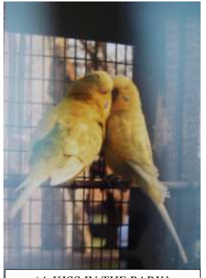
'A KISS IN THE PARK' Priory park, Chichester