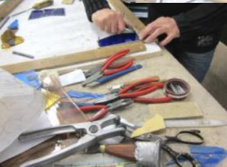
Having traced his design onto tracing paper with thick black lines to show where the lead will be

placed, he numbers each individual section corresponding to the Cartoon before he cuts the patterns out using very clever three bladed scissors, which actually cut a thin strip off the pattern so enough room is left for the lead when pieced together. These templates are put onto the glass which is scored and then 'cut' using either a diamond cutter (the best and never wears out) or a Tungsten one. Monsieur's diamond cutter went walk-about after a tourist visit and he now uses a Tungsten one which has to be replaced every now and then. After cutting, the Cartoon is placed under a sheet of clear glass onto which the newly cut pieces are laid, sticking them down with a little melted beeswax to stop them slipping, as this is when the 'grisaille' [painting on glass] happens. The paint is a mixture of ground glass, metal oxide and vinegar and is applied using a variety of brushes and pads to create the desired effect. It is left for 3 days to dry then goes into the kiln at 600 degrees for 3 hours which just fuses the grisaille into the glass, becoming permanent. Now he cuts and shapes the lead starting