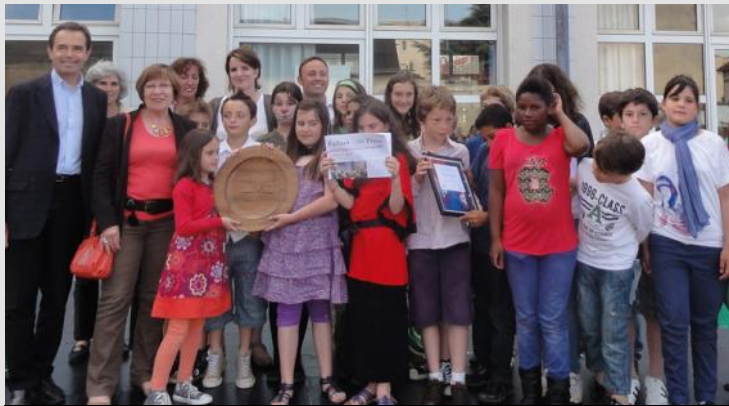
HONNEURS. Les CM1/CM2 viennent de recevoir leur trophée.

Le sujet choisi pour 2012 était "Les quatre éléments sur tapisserie". Les jeunes de