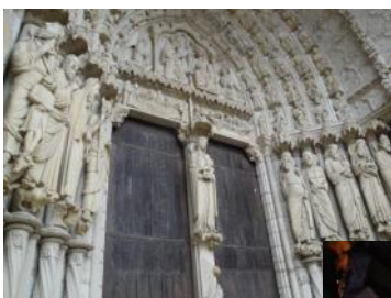
Cathedral North Portal . . . + 'coloured' at night (right)

Félicité then took us outside to look in detail at some of the sculptures, first to the South Portal that had not yet been cleaned, then to the North Portal and finally to the Royal Portal at the main entrance, which had both been cleaned. She talked about the cleaning techniques that were being used, and how these had been modified to be less invasive as some of the earlier techniques