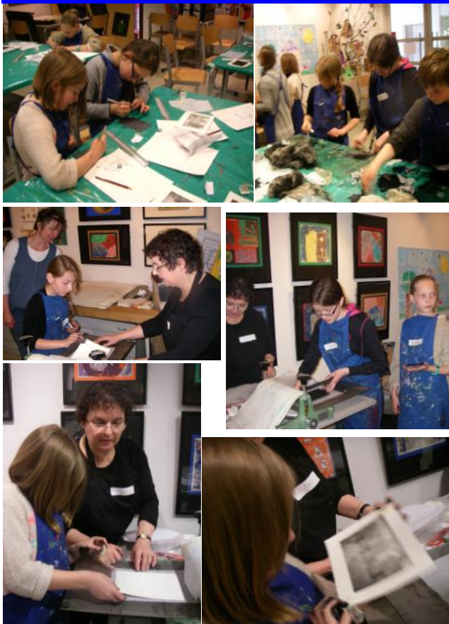
Below: Pupils from the 'Highly Commended' schools: (l-r): Lavant House; Boxgrove Primary and Lavant Primary School