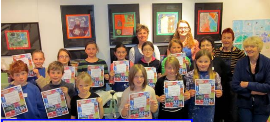
Pupils from the Arts Award 2013 Trophy Winner - Parklands Community Primary School - proudly show their personalised achievement Certificates