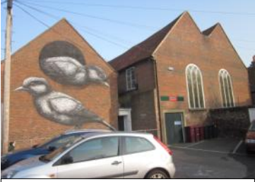
'Landed safely (for the nesting time?)' Baffins Lane Car Park, Chichester