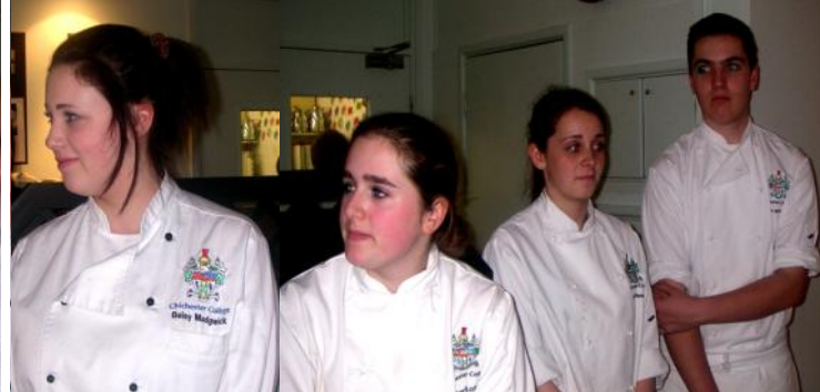
The aspiring student chefs accepted our invitation to 'make an appearance' with the 'front of house' students in the Goodwood Restaurant (see page 4 for more photographs and article)