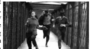
Scene from “Jules et Jim”: Catherine cheats in a race

In 1964, Truffaut made his first colour film, “Fahrenheit 451”, based on a sci-fi novel by Ray Bradbury and starring Julie Christie. This was a surprising choice as the film is acted in English, a language in which Truffaut had very limited proficiency