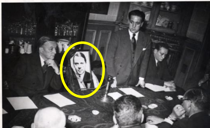
A meeting of the CNR in Paris in 1945 which shows a (highlighted) photo of the missing Jean Moulin. The person sitting next to the photo is Georges Bidault, future Prime Minister of France.