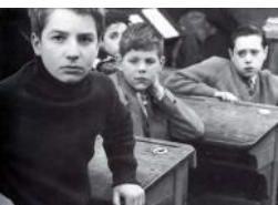
Antoine gets into trouble at school

Truffaut’s first film, “Les 400 Coups” (The 400 Blows) filmed in 1959, is based on his own adolescence. It tells the story of Antoine Doinel who comes from a troubled background and ends up in a reform school. In this film, Truffaut makes use of the new hand-held camera to film outside. The result is a quickly moving scene, quite unlike those seen