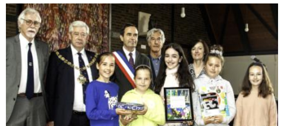
Winners: above St Richard's RC Primary School