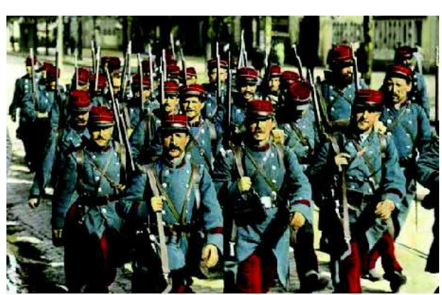
Mobilisation des troupes, août 1914

Remembrance of the war in this country is understandably very much from a British perspective. The question is seldom addressed about our French ally, "What was it like for them?" Whilst many experiences were the same, there were also major differences, the most obvious being that France was invaded and thus the war was fought on French soil. 10% of France was invaded and devastated by the war, with 12.1/2 % of its population affected. France therefore suffered substantially more war damage than all the other combatant nations, perhaps explaining the country's desire for the controversial war reparations at the Treaty of Versailles. The casualty levels were also higher, with France losing 893 men per day against the British (only) 511. The clearing-up operation after the war was also very much a French challenge, with 140 square miles of barbed wire to be removed, miles of roads, railways and canals to be repaired, and thousands of buildings to be rebuilt.